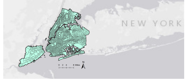
Figure 1: Study area: New York City census tracts

With the promising results achieved in these studies, it is evident that these modeling efforts enhance traditional approaches. However, more research is needed to fully grasp the potential of social media in predicting mobility patterns at small spatial scales using new techniques and integrating traditional and new datasets. The application of artificial neural networks (ANNs) in travel demand modelling was introduced in 1960. However, despite their success at learning and recognizing patterns, they were not used for about three decades due to their slow response to the inputs' modifications [24]. ANNs have shown great advantages in prediction, pattern identification, optimization, and signal processing due to their non-linear and flexible structure that can solve complex problems [6]. While ANNs have been used in different transportation studies [i.e. 21], their applications in understanding and modeling mobility patterns within cities need further investigation.